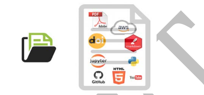
Figure 1 - Examples of documents in the GEO Knowledge Hub

The contents of the GEO Knowledge Hub are linked documents that contain relevant information for Earth observation applications that promote reproducibility, scalabity, and co-design/co-production . Examples of documents include an HTML file, a PDF file (report of paper), a Jupyter Notebook, an R or python markdown file, a GitHub page, a repository entry linking to a dataset store with an assigned Digital Object Identifier (DOI), an Amazon Web Services (AWS) or other links to datasets, OGC service links for data, a video (see Figure 1). We also use the term document set to describe a set of documents linked to the same application.