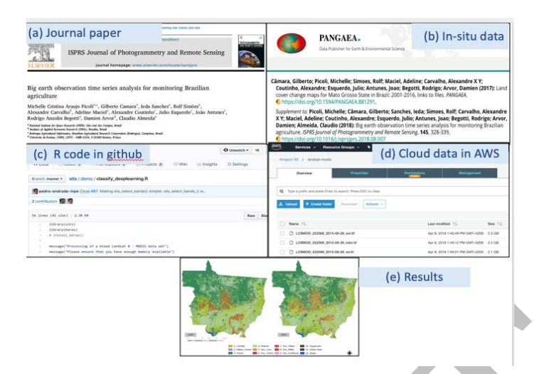
Figure 2 - A document set with five components